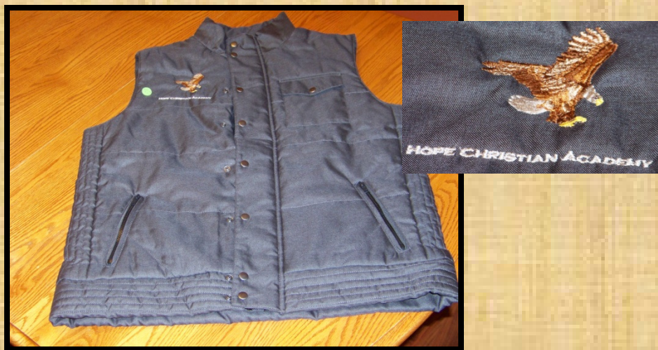
Item No. 500